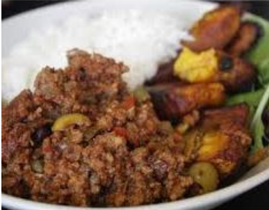
PICADILLO A LA HABANERA